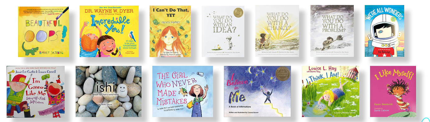
(click on the image to see the book on Amazon)

6. Use literature to explore how characters develope their self-esteem and solve challenges.